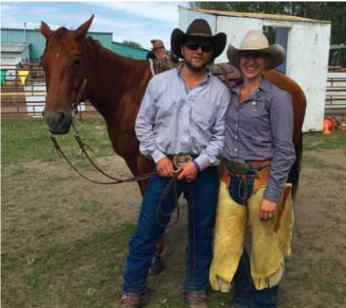
Saskatchewan Cowboy Mounted Shooters